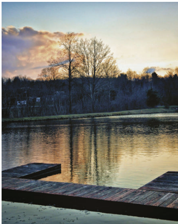
Sunset Reflection