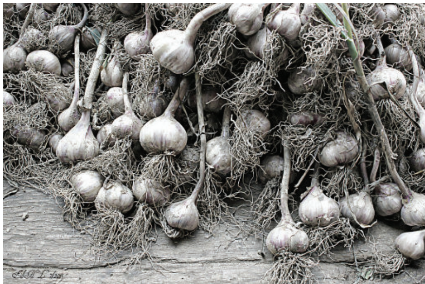
A Good Harvest