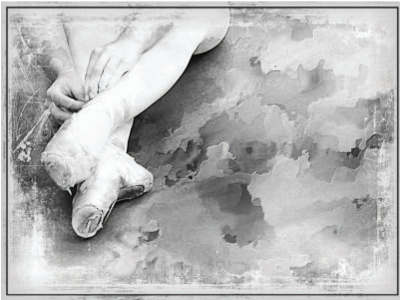
Toe Shoes