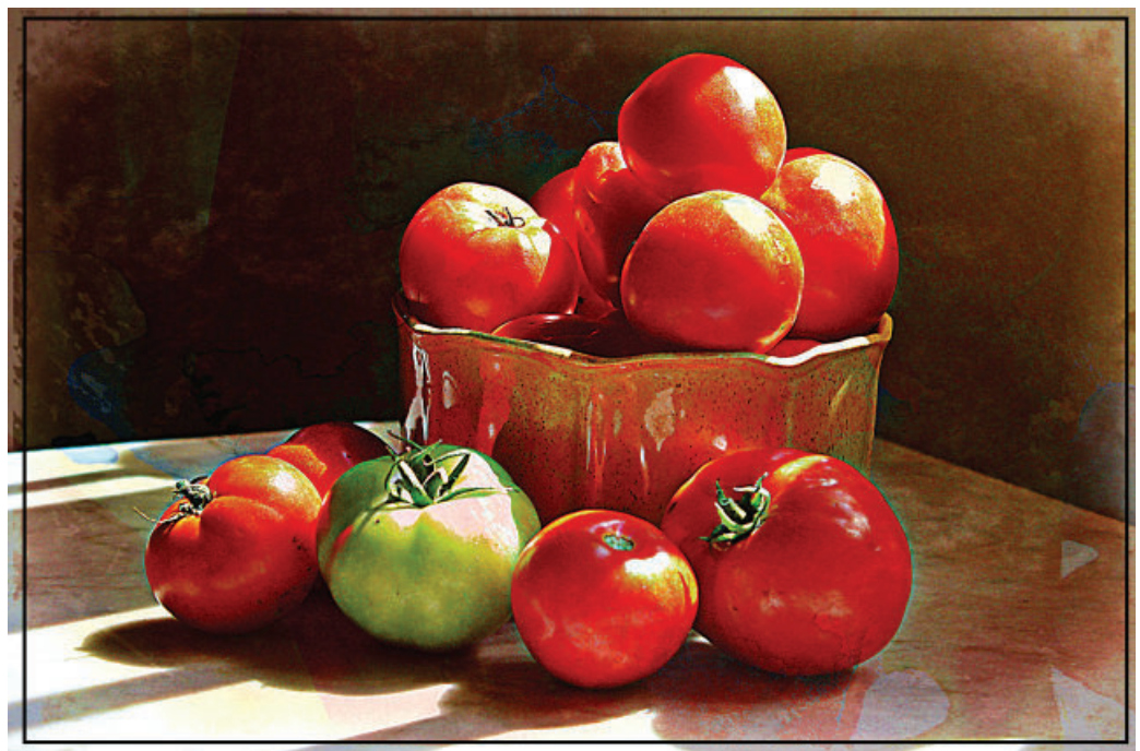
Tomatoes in a Ceramic Bowl

If you've been OUT AND ABOUT let us know about it. We'd love to share your success stories with the membership!