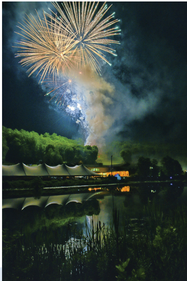
Fireworks at Shawnee