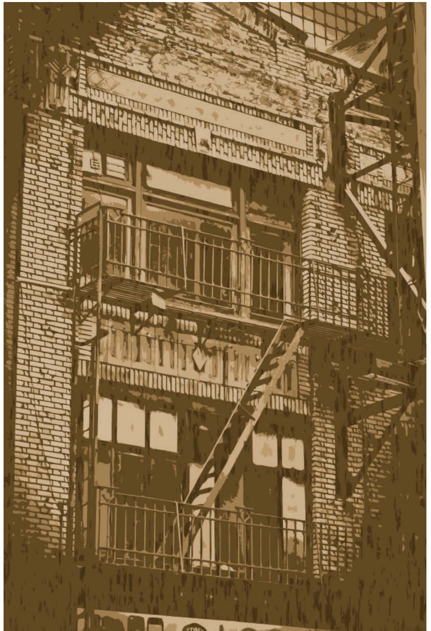
Old NYC photo by Angelo Pacheco