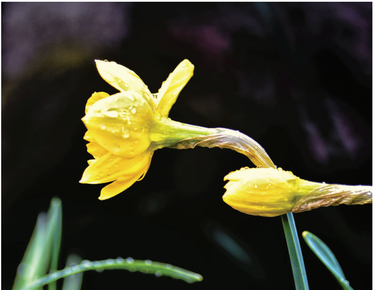
Daffodil Portrait