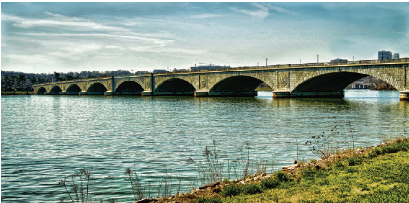
Washington Bridge