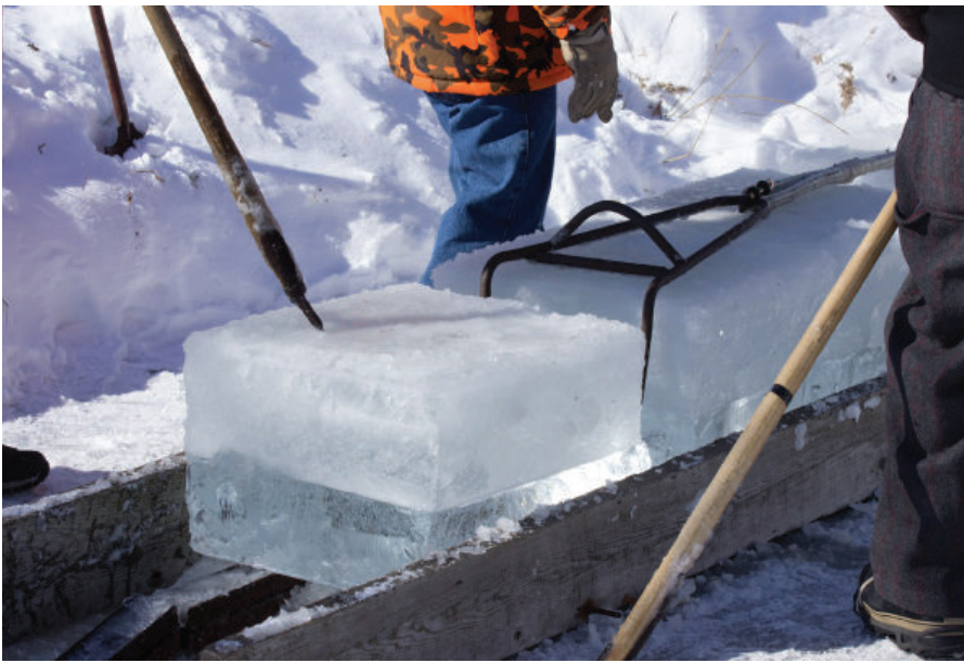
Ice Cutting at Mill Pond.