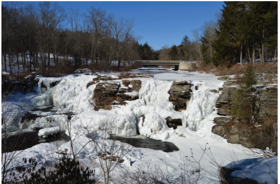
From the JANUARY "SHOOT OUT" Resica Falls