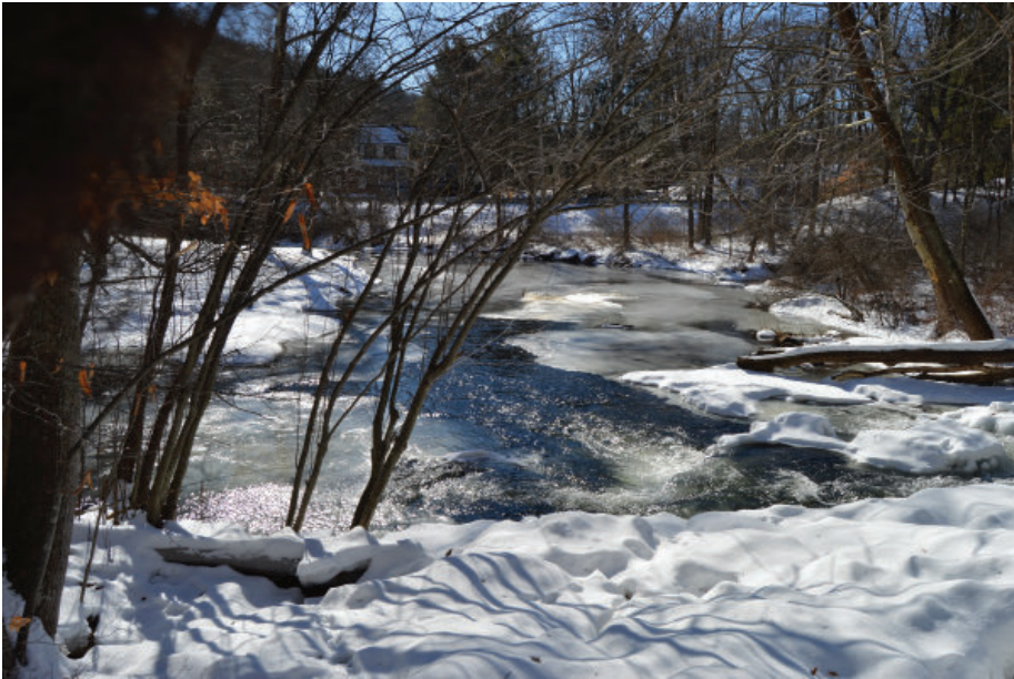
From the JANUARY "SHOOT OUT" Below Buttermilk Falls

Hello All, we have some really great things coming up this year. The first one I would like to talk about is the upcoming Shoot Out at Crystal Cabin Fever on February 21, 2015. This is a display of ice carvings at The Sculptured Ice Works at 311 Purdytown Tpk in Lakeville, PA. This is a public venue so bring your friends and have a good time. The theme this year is "Under The Sea" with some beautiful sculptures and some live carving events. There is an admission fee of $15 for adults, $12 for seniors and $10 for children (ages 4 to 14). There are usually additional wood carving demonstrations in the rear of the building as well. The hours of operation on Saturday are from 11am to 6pm for more info see the their web site at crystalcabinfever.com or call 570-226-6246. Anne LeFevre