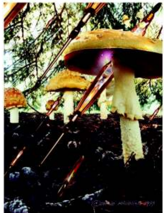
Raymondskill Mushrooms