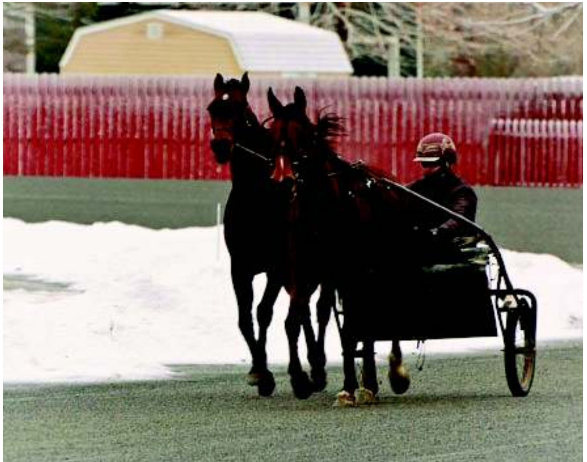
Harness Track