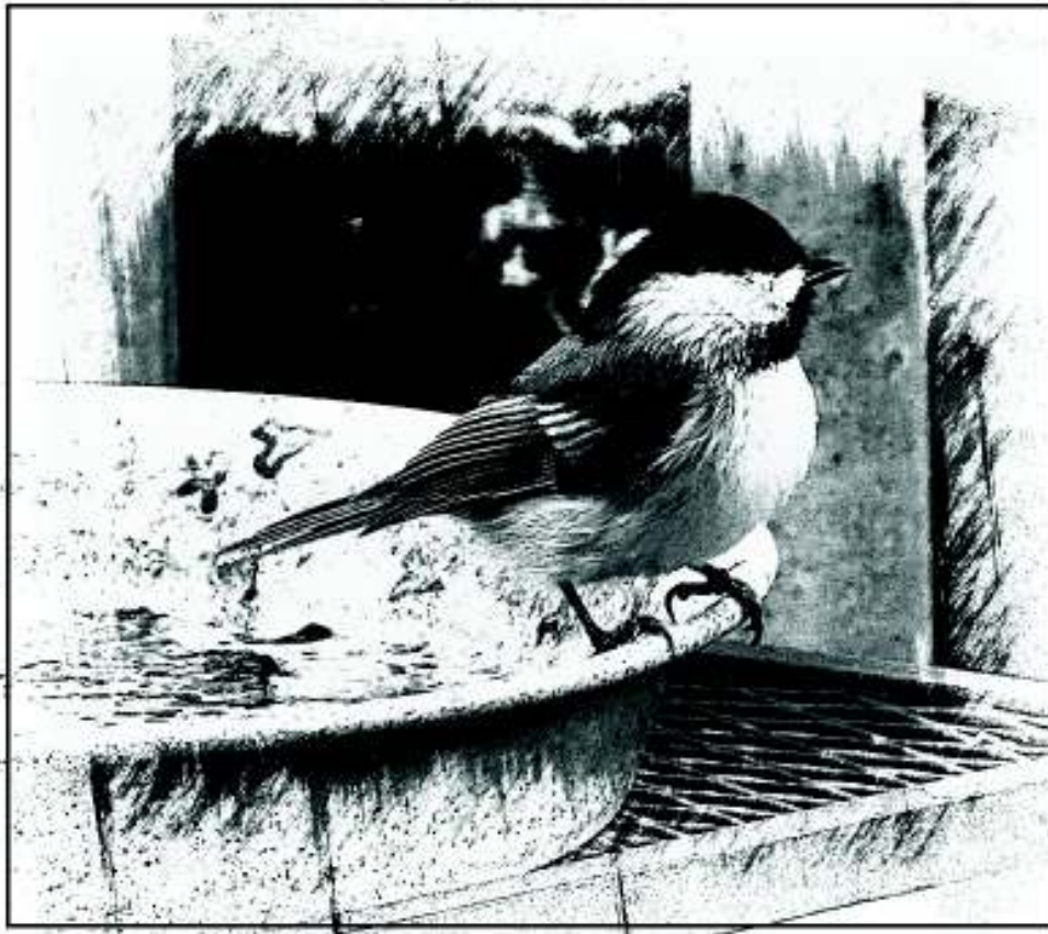
Black-Capped Chickadee