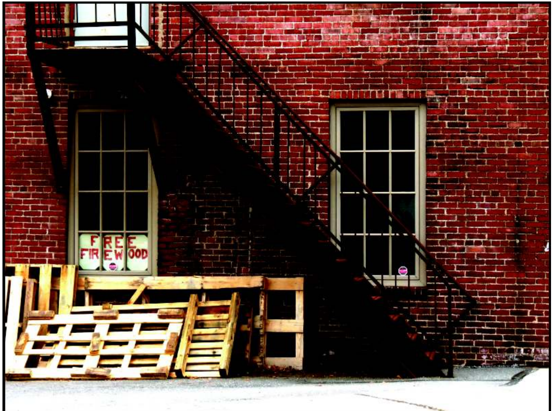
Free Firewood

This meeting will be a workshop on Abstract Still Life Photography . By using common household items we will create a series of abstract images through manipulation of the light and background. Cameras with a tripod would be helpful in this exercise but are not required. Also using macro photography techniques may yield some interesting results. Feel free to bring items that you feel would work well for this, we will keep changing the set up on the tabletop to see what we can come up with. After the meeting, Email 2 or 3 of your best images to Dick Ludwig and we will show them for the Curtain Raiser in March.